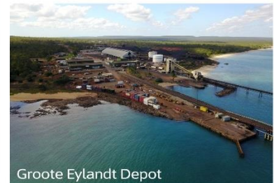
Groote Eylandt Depot

For Government assistance programs and other information, check out the sites below: