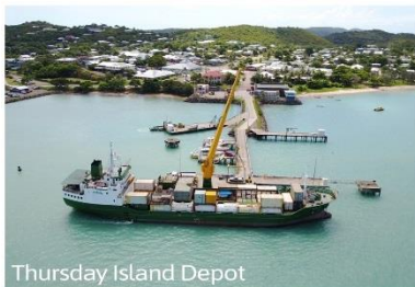
Thursday Island Depot